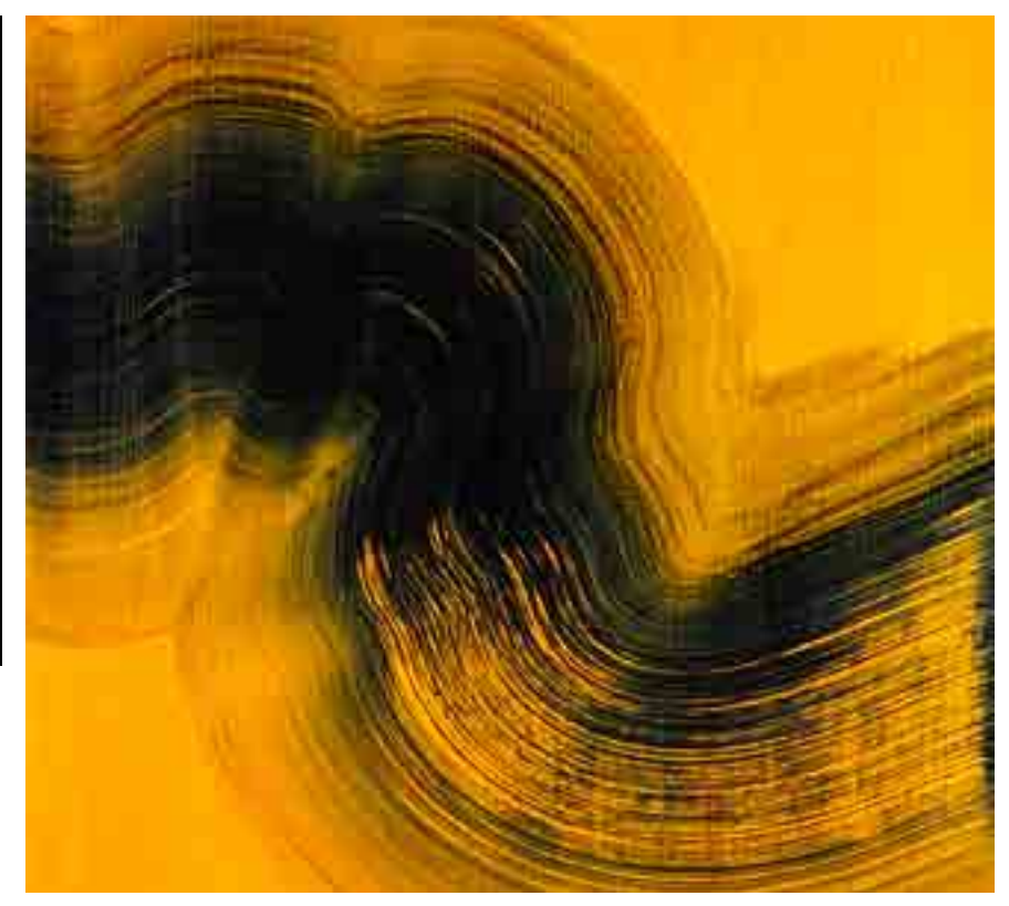
Seven Seconds Melissa Wraxall, Seven Seconds Red-Gold