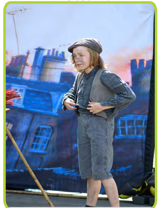
BEDLAM FAIR - Circle of Two

130 Performances 47 Art Events & Shows in 36 venues by over 600 artists & performers to an audience of about 20,000 over 17 days (and a few more)!