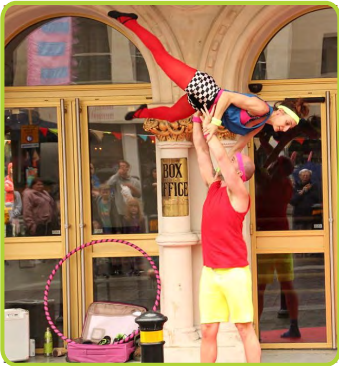
BEDLAM FAIR keeping out of the rain

Everyone who lead the project was brilliant – professional, friendly and they clearly knew their stuff. From start to finish a fantastic experience!