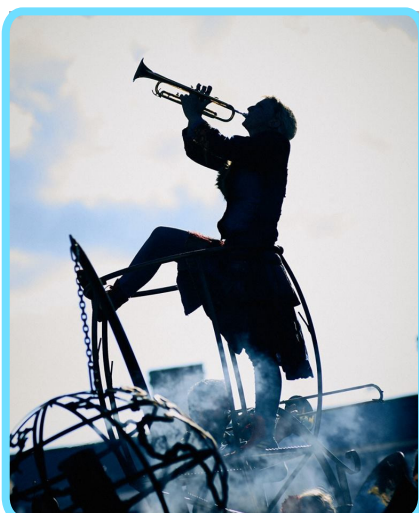
RAMSHACKLIOUS

"Love the set-up great use of space" "Most bizarre show I've ever seen" (Ramshacklicious) "Very jolly!" "Thoroughly enjoyed sitting in Kingsmead Square" (over 85 yrs) "Keep funding the Arts!" - Audience members at Bedlam