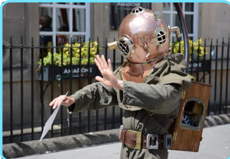
BEDLAM FAIR

Our Arts Council-supported New Work Works project supporting new street shows had more applicants than ever before, and included a number of more established high quality artists, bringing more mayhem, laughs, quirky art and astounding skills to SawClose and Kingsmead Square. Bedlam really showed us a vintage year this year, and was visited by the leading national organisation in the sector (Independent Street Arts Network, now renamed Outdoor Arts UK ) putting us properly on the national map.